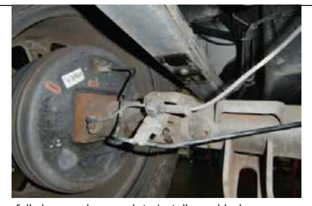
Carefully lower axle enough to install new block