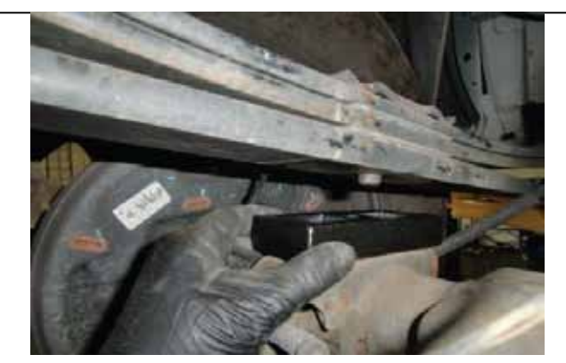
Place new block into position (1.0" block shown)