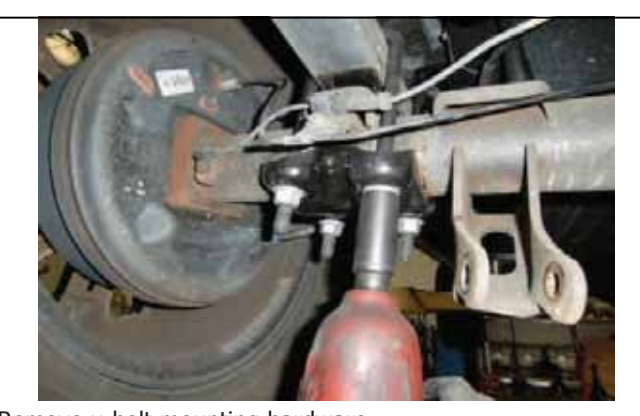
Remove u-bolt mounting hardware