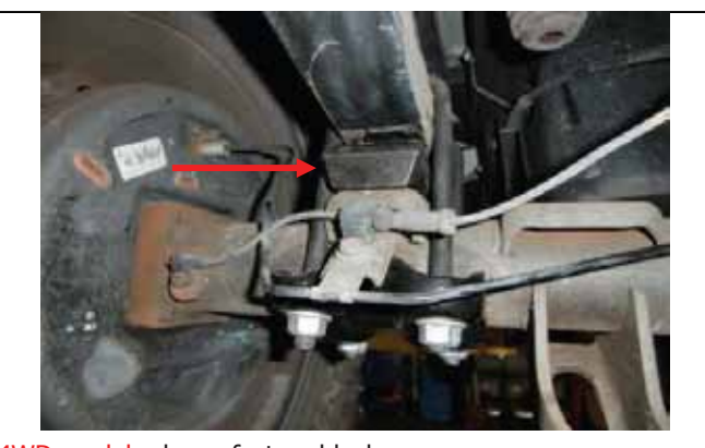
4WD models shows factory block