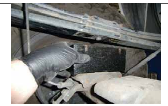
Shown (3.0" block) replacing factory block on 4WD models