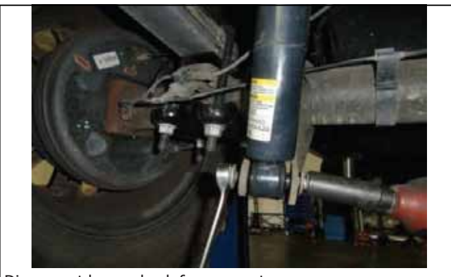
Disconnect lower shock from mount