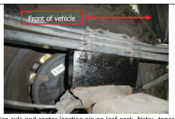
Raise axle and center locating pin on leaf pack. Note: taper