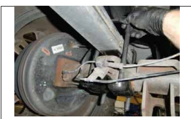
Remove u-bolts and axle mounting plate