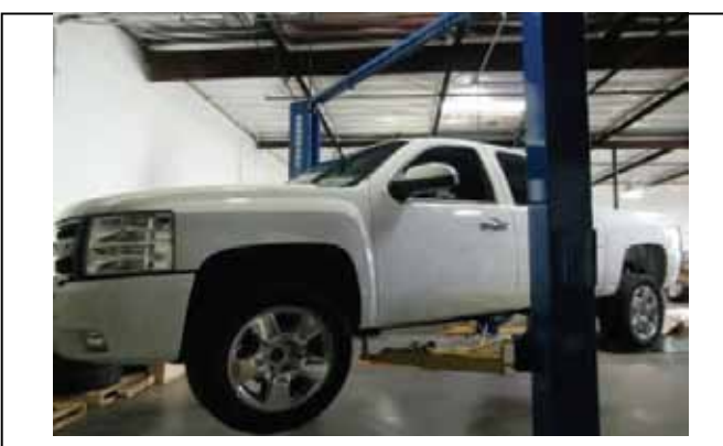
Raise and support vehicle by frame on jack stands