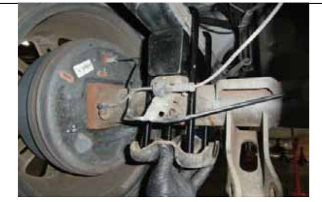
Reinstall axle mounting plate