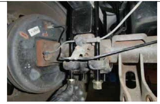
Install new hardware

Recheck all work performed, torque hardware and lower vehicle to ground and test drive.