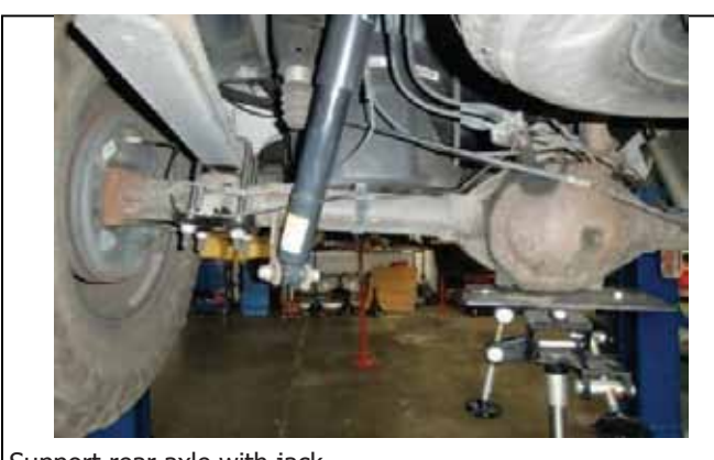
Support rear axle with jack