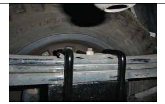
Place u-bolts over saddle on leaf pack and over axle