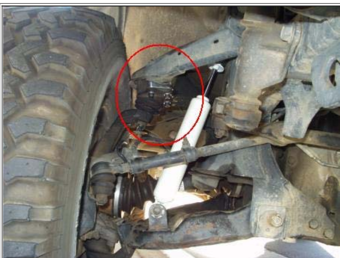
Ball Joint Spacer Installation