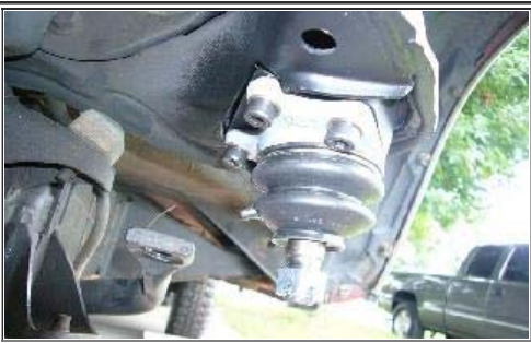
Closeup of trimmed upper control arm.