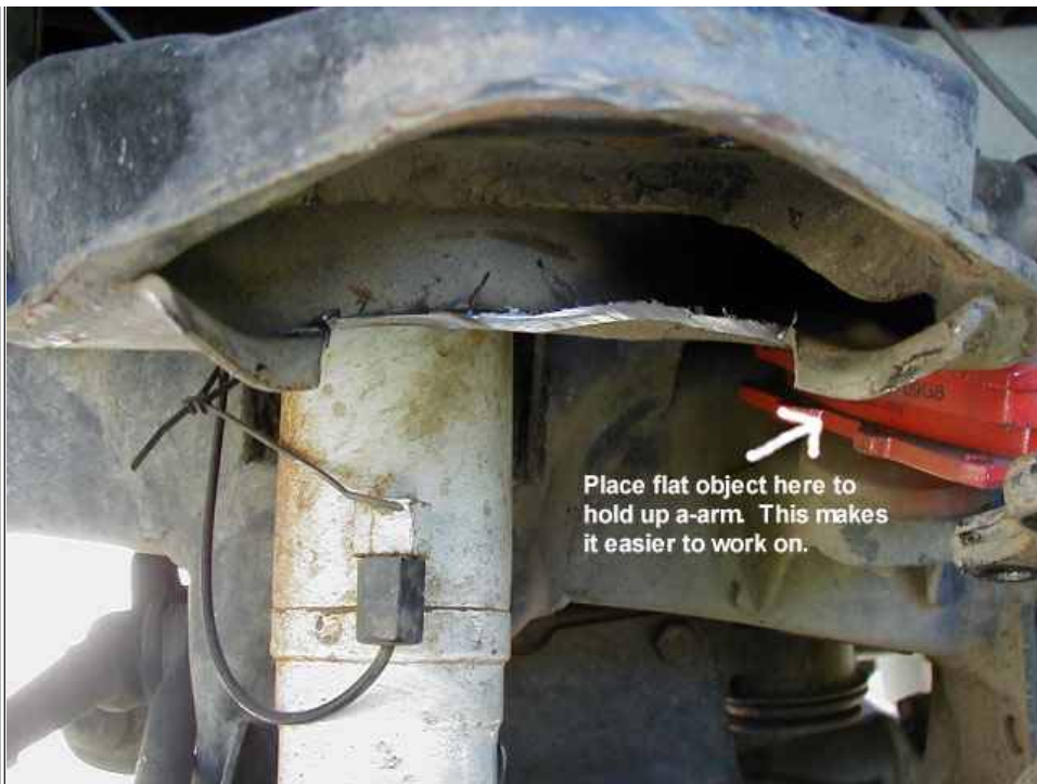
Trimming around upper ball joint