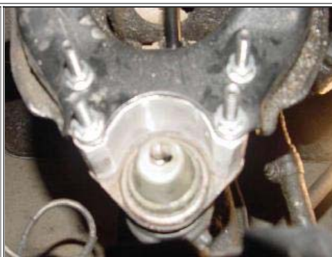
B: Spacer and Ball Joint Reinstalled