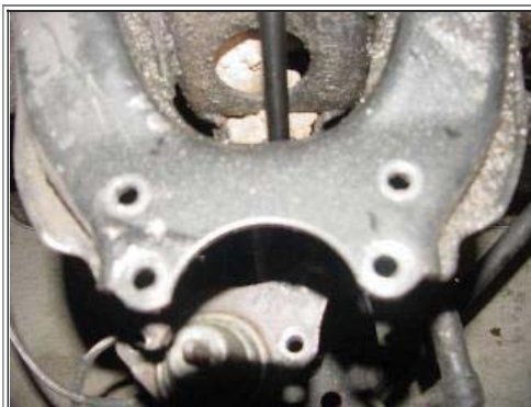
A: Upper Ball Joint removed