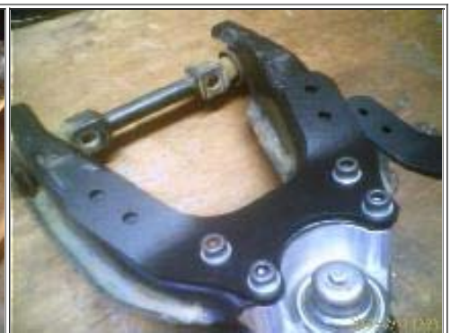
C: Upper Control Arm Brace